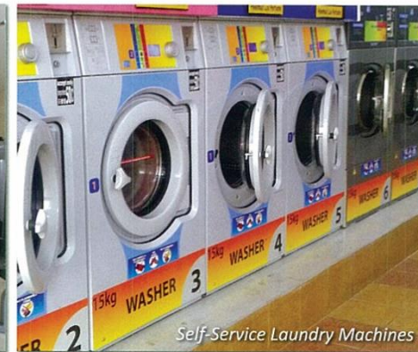
Self-Service Laundry Machines