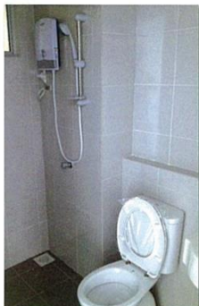
Toilet & Bathroom